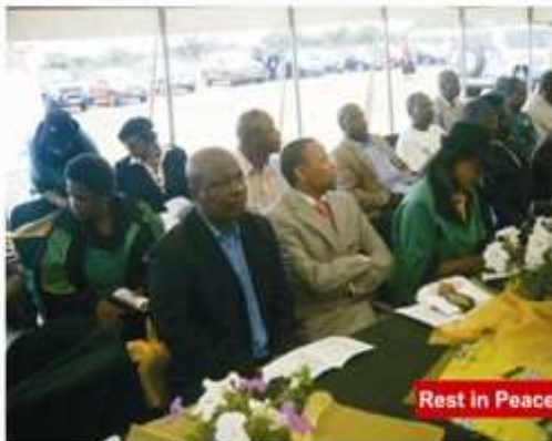
Rest in Peace

Thabazimbi Local Municipality has in the past month or so lost three of its members.