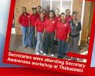
Secretaries were attending Secretary Awareness workshop at Thabazimbi